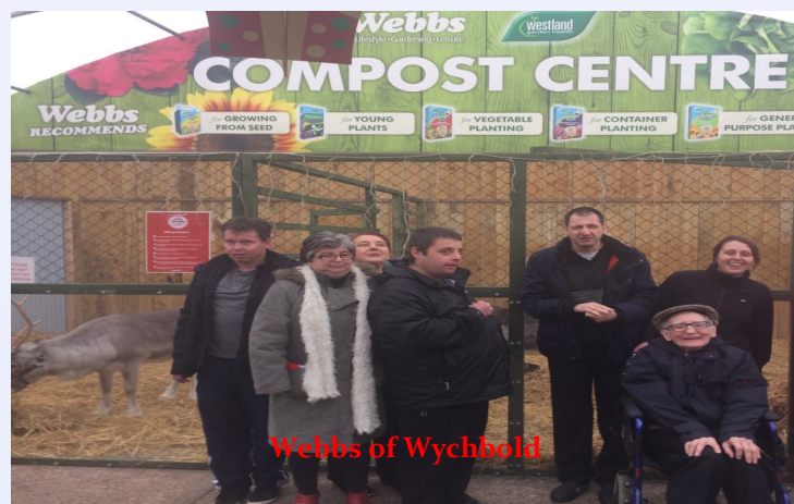
Webbs of Wychbold