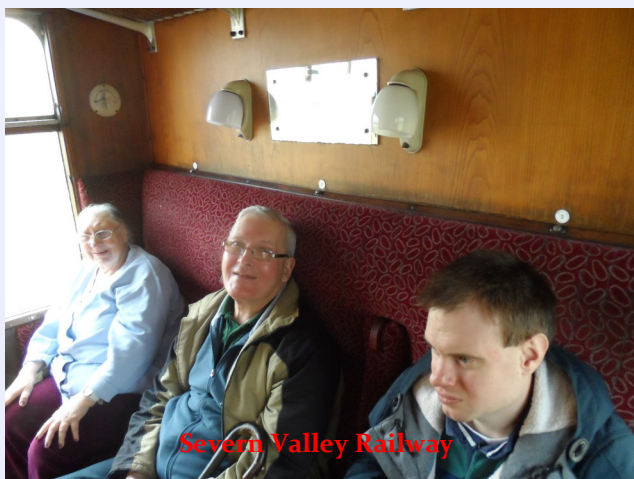
Severn Valley Railway