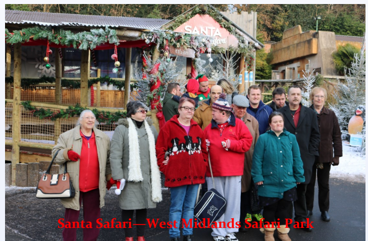
Santa Safari—West Midlands Safari Park