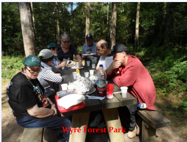
Wyre Forest Park