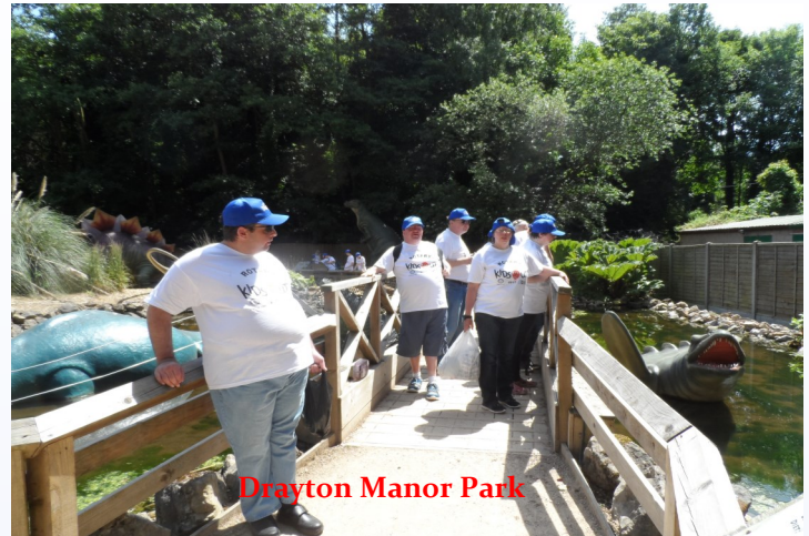
Drayton Manor Park