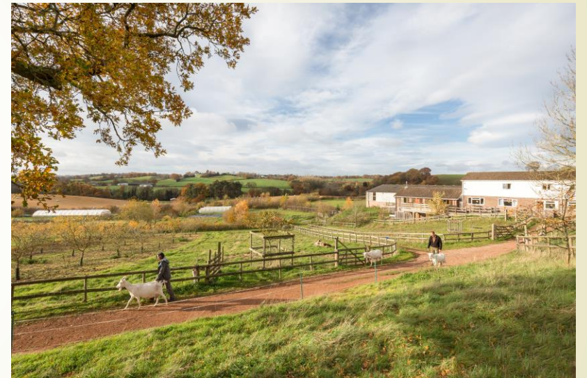
Vale Head Farm